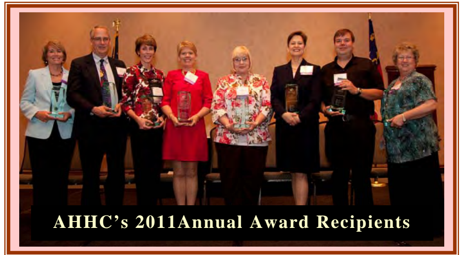
AHHC's 2011 Annual Award Recipients